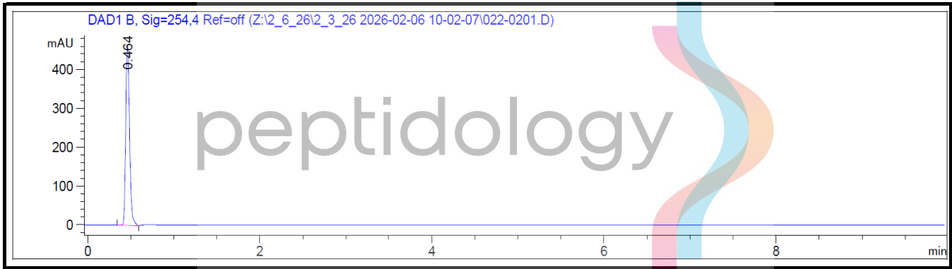
Chromatogram for vial A shown above.

Compound: 5-Amino-1MQ Amount: 60 mg Laboratory ID: V260130-10 001 Date Reported: 3/9/2026 Lot Number: 1670