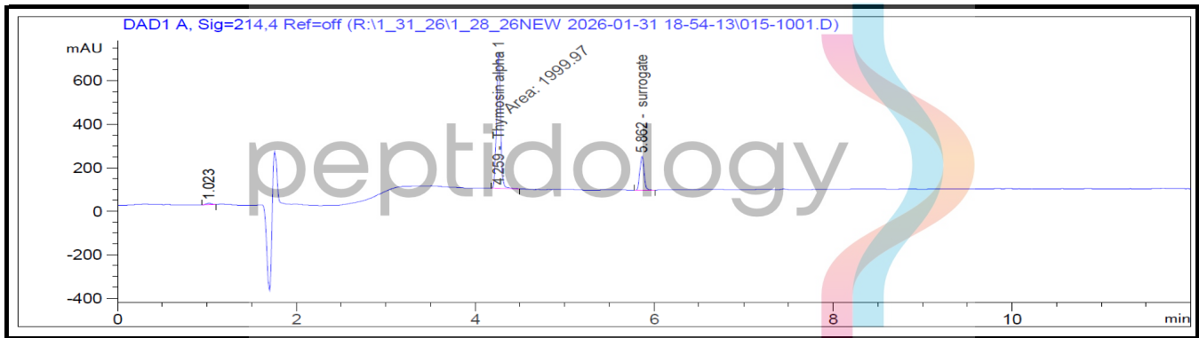
Chromatogram for vial A shown above.

Compound: Thymosin Alpha-1 Amount: 10 mg Laboratory ID: V260129-7 001 Date Reported: 2/26/2026 Lot Number: 1670